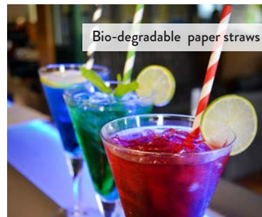
Bio-degradable paper straws