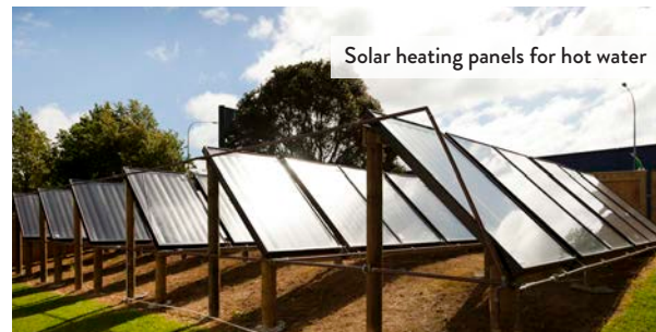
Solar heating panels for hot water