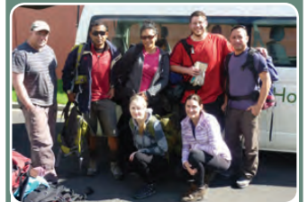
Staff volunteers helping to save the Kokako at Hunua Ranges, North Is. NZ

The kokako is one of NZ's endangered and endemic (that is, found only in New Zealand) birds (650 pairs left @ Nov 2012). A joint project between the Auckland City Council and Department of Conservation, The Kokako Project was created to protect and save the kokako. Jet Park Hotel is proud to be a part of this project.