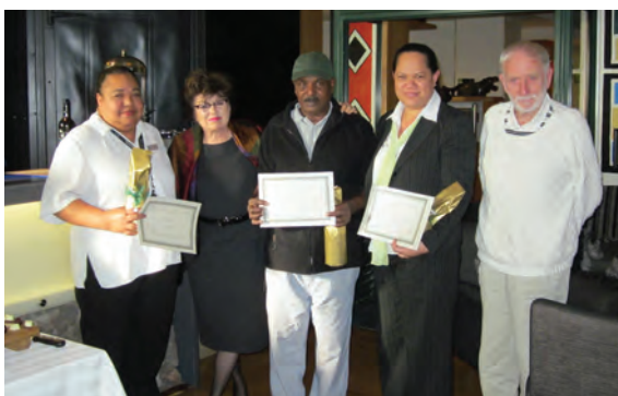
AT OUR STAFF CELEBRATIONS 2012: