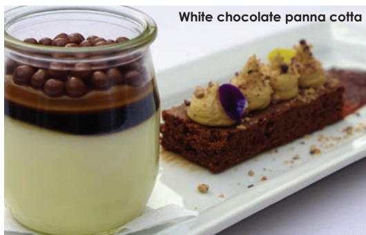
White chocolate panna cotta

We understand that travellers need a range of dining options- sometimes a leisurely meal to celebrate the start of your holiday, other times to snuggle up in your room with some "comfort food". Our menus offer flexible options for dining no matter what time of the day. On offer are a lounge bar snack menu, kids menu, current pizza/ mulled wine special, quick lunches, room service, all day and late night dining, and a superb a la carte menu.