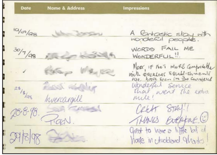
Excerpt from original Guest Feeback Book in 1998: