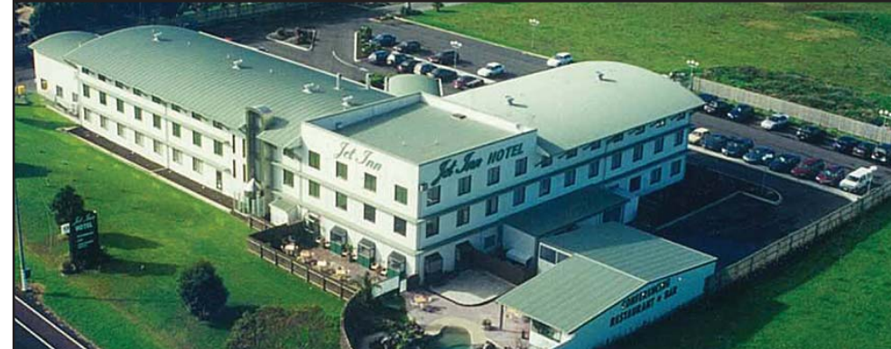
Top: Jet Park Hotel as it stands currently. Below: Original hotel building in 1998.

I hope you will continue to join us in the years to come as a valued guest, and that you will enjoy all that we have to offer with our new extensions.