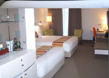
From Top: Overnighter Room & Deluxe Twin Room, South Wing.