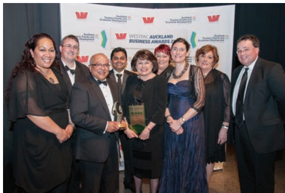
Our Management Team at Westpac Auckland South Business Awards 2013

Our ever popular and longest standing rooms- 40 Standard Queens have received a full refurbishment. The rooms feature new furniture, headboards, light fittings, carpets, throws and cushions together with a wall-mounted 32 inch LED flat screen television.